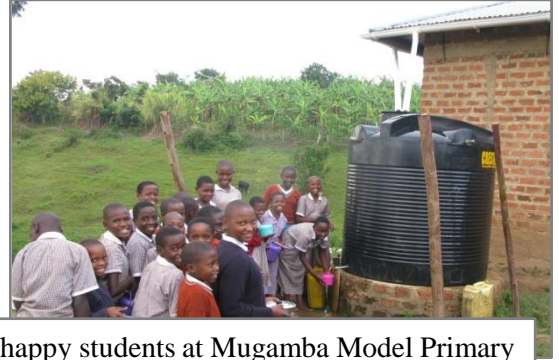
Very happy students at Mugamba Model Primary