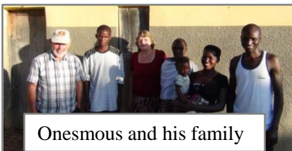
Onesmous and his family

Project Uganda is run with minimal overheads, all project visits to Uganda are self funded and all marketing materials and stationary are either donated or subsidised by supporting local businesses.