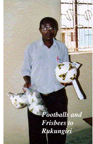
Footballs and Frisbees to Rukungiri

Over 40% of the 800 children in the school have lost both parents through AIDS and two hundred of these children are supported through the efforts of Global Care.